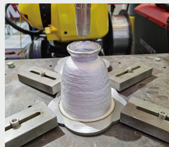
3D Additive Welding